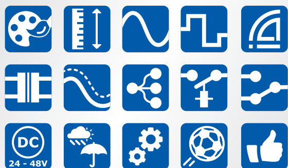
Illustration in colour option, see mechanical properties

See last page for explanation of the symbols.